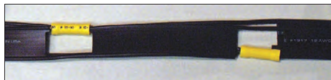
Figure 3 — A balanced line "long splice" with butt connectors, ready for crimping. By keeping much of the between-conductor web intact, it can be used to remove strain from the connections. For soft copper wire, a Western Union splice can be used, while copper-plated steel requires other measures, such as the crimp connectors shown.

The FCC no longer issues secondary station licenses, and hasn't for decades. You also are no longer required to notify the FCC if you are operating portable. You can utilize a portable designator, such as K1CGZ/4, if you are operating from a station at your second home in Florida, but you are not required to do so. You can make use of modifiers to help people know where you are, if you wish. Some contests (particularly VHF contests) may require using a call area designator to indicate where you are, if not indicated by your actual assigned call sign, or in other situations in which your call sign